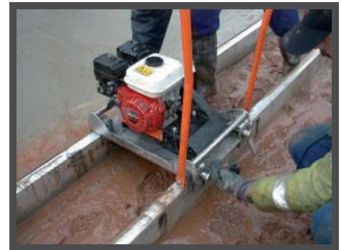
'QUICK CLAMP' SYSTEM FOR TOOL FREE ON SITE ASSEMBLY