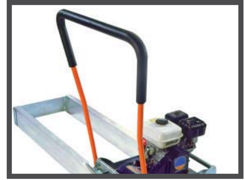
LOW HAND-ARM VIBRATION COMFORT HANDLES