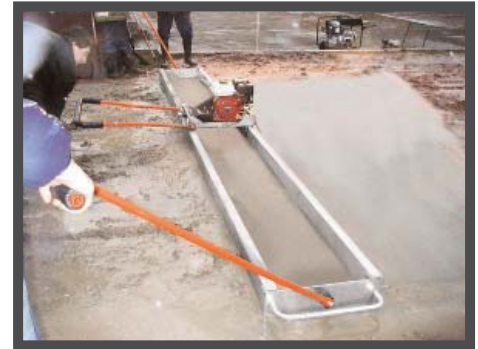
CAPABLE OF SCREEDING AREAS UP TO 7.2 METERS